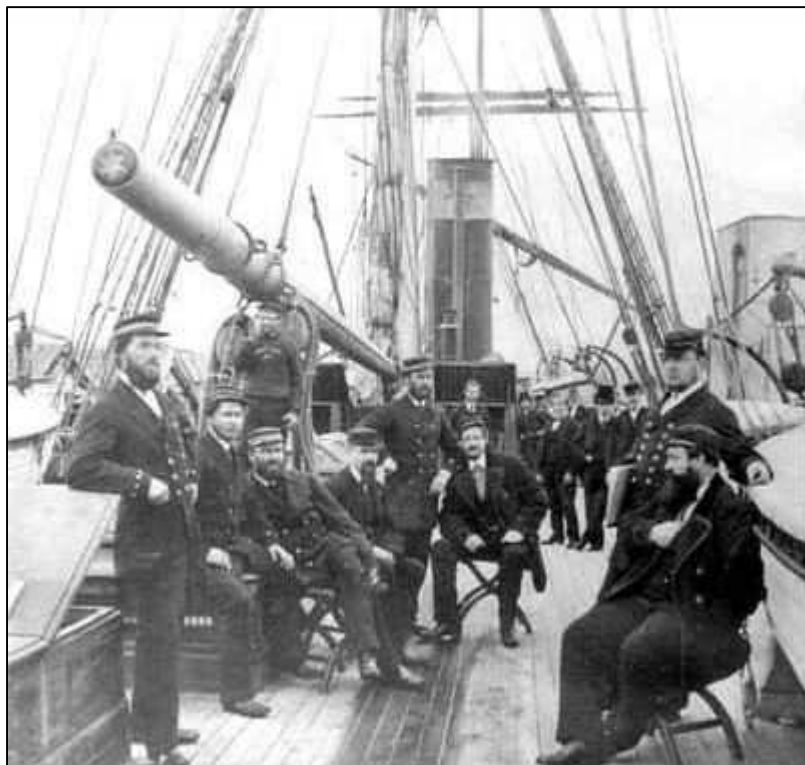
Officers on deck of the steamship Idaho

Life aboard seemed to be uneasy for the emigrants, according to this citation from a passener: "... You can imagine what an unpleasant journey it was with over 1,100 emigrants, crammed together, most of us were treated worse than wild animals. We hardly ate anything at the start of the journey since we are not pigs, but when we began to understand the situation and our own provisions were not enough, we had to accept the food that the pigs ate ... when we walked on deck the muck went over our Shoes and into the meat container, one should wash it but the Irishmen had washed their children's messes and night pots first ..." ii